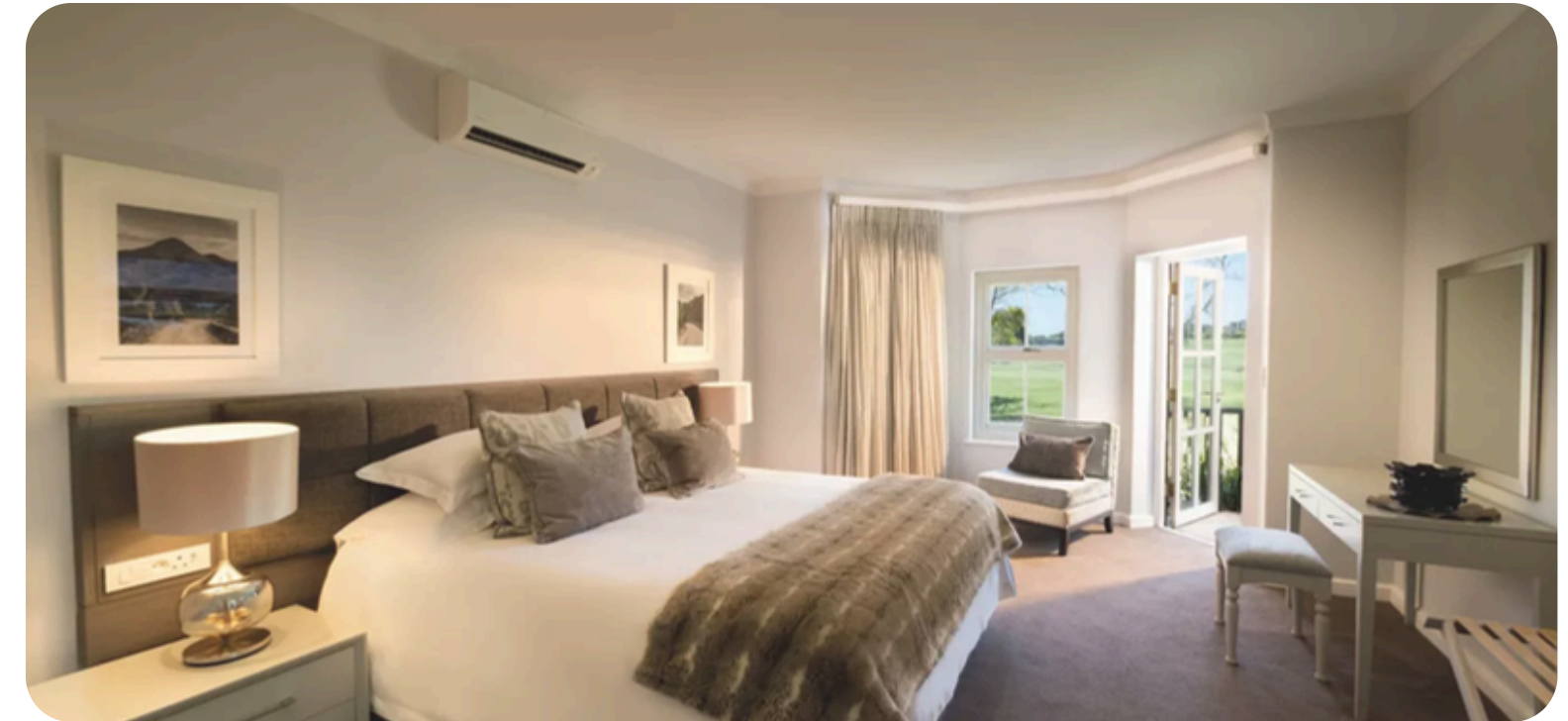
View Fancourt Hotel

The exquisite One Bedroom Suites offer an elegant and expansive retreat. Each suite features a plush king-size or twin-bed bedroom, a separate lounge area complete with its own TV, and either a balcony or patio that overlooks the gardens, driving range or the majestic Outeniqua Mountains.