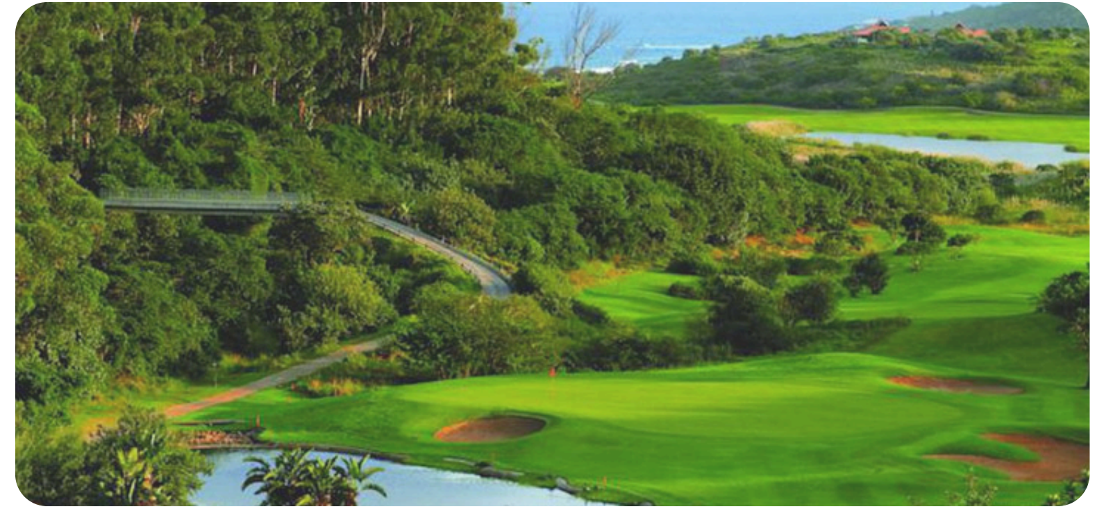
View Zimbali Country Club

Consistently ranked among South Africa's top courses, Zimbali Country Club delivers a memorable round defined by technical play, scenic diversity, and a tranquil, nature-rich setting.