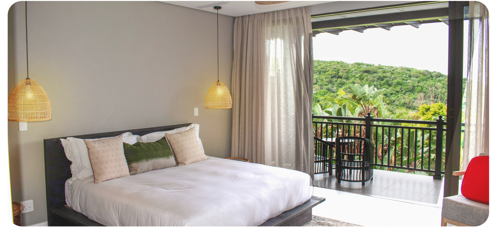
View Zimbali Lodge & Spa

Zimbali Lodge by Dream Resorts is a refined coastal retreat set within the lush forest canopy of the Zimbali Coastal Estate on KwaZulu-Natal's North Coast, just minutes from Ballito and a short drive from King Shaka International Airport. Blending classic elegance with modern comfort, the lodge offers stylish suites and self-catering options surrounded by indigenous vegetation and tranquil ocean views.