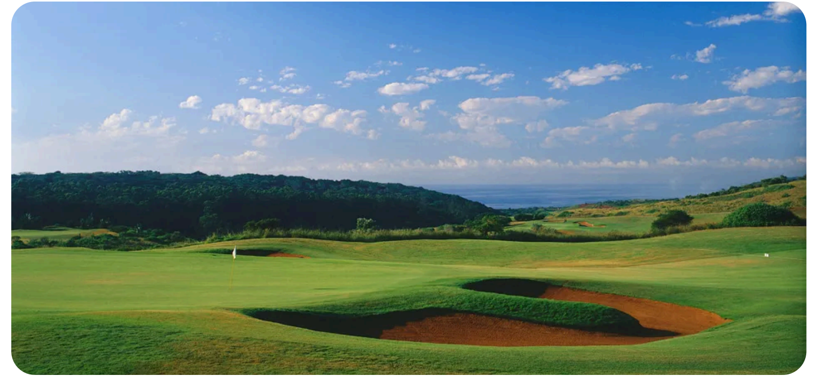
View Zimbali Lakes

As a modern, eco-conscious development, the course incorporates sustainable practices and preserves the natural environment, delivering a contemporary golfing experience that combines luxury, innovation, and scenic beauty.